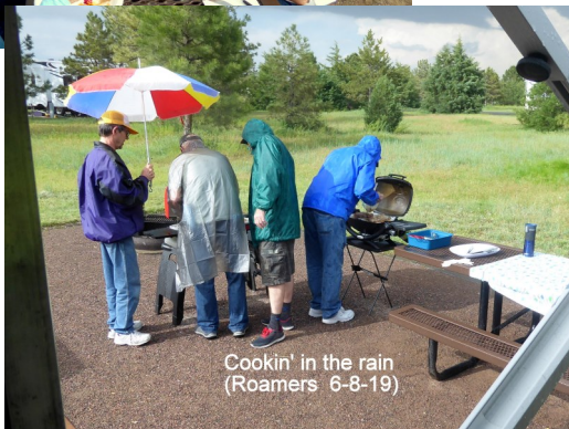
Cookin' in the rain (Roamers 6-8-19)