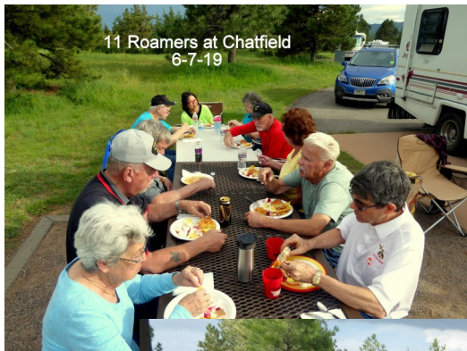
11 Roamers at Chatfield 6-7-19

Our July outing will be at Mountaindale, one of the Roamers' favorite places. The same ones from last year signed up, plus a couple more, staying for four nights. In August there are already 14 for Winding River. Some great fun lies ahead!