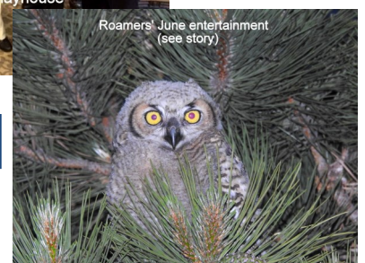
Roamers' June entertainment (see story)